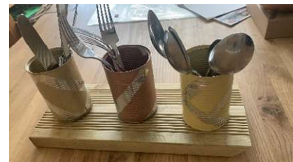
Miguel Arizabalo-Peralta (Year 8) - Covid art