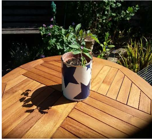
Kameron McNamara (Year 8) – creative use of tuna and its tin!