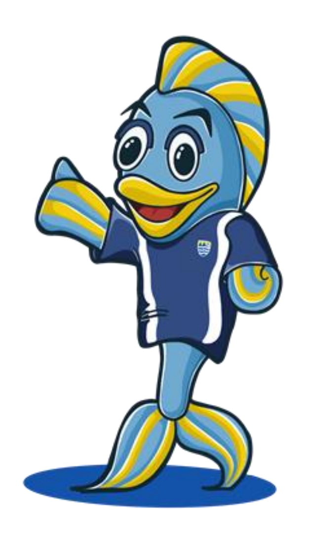
"I'm looking forward to meeting you soon" Brooky