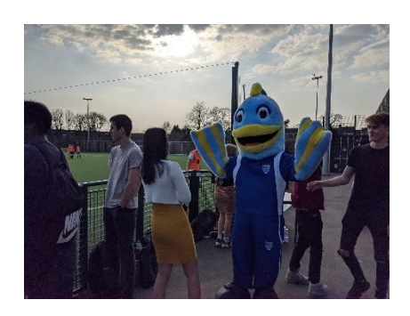
6th Form Football

Throughout the year a variety of events take place, supporting the pastoral curriculum by expanding the children's learning and social experiences. A few examples in the last year are below, but please feel free to check our Facebook feed for more examples.