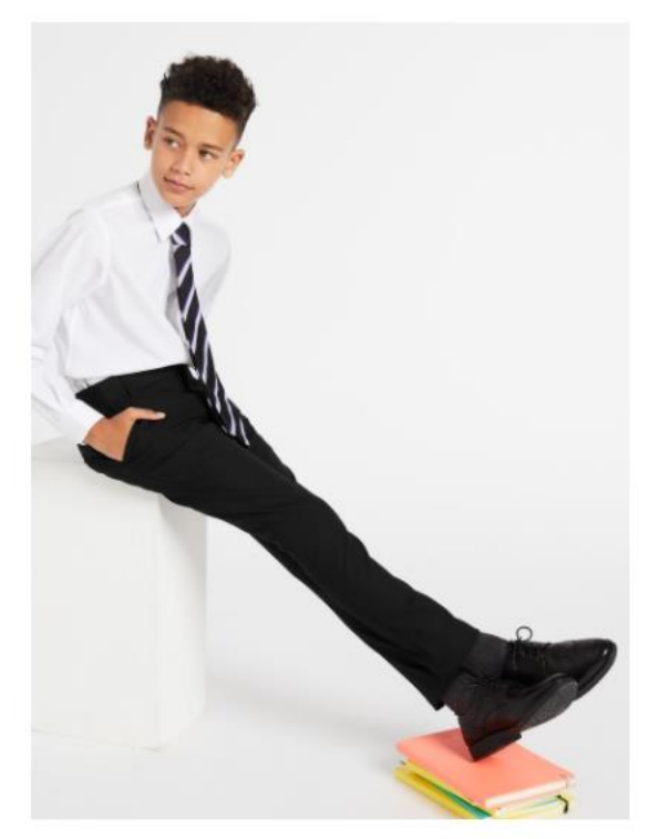
Boys Plain Uniform

Last year we introduced our plain uniform section onto the website, and this proved to be extremely popular with all our customers. We will continue to sell in this section a range of our bestselling trousers, skirts, shirts, pinafores and more so that parents will be able to place any orders in the same basket as their bespoke uniform purchases. Whilst we will endeavour to ensure availability of as many of these lines as possible, it may sometimes be the case that we sell out of stock on this page and if this is the case the full range of core uniform will always be available on <u>www.marksandspencer.com</u>