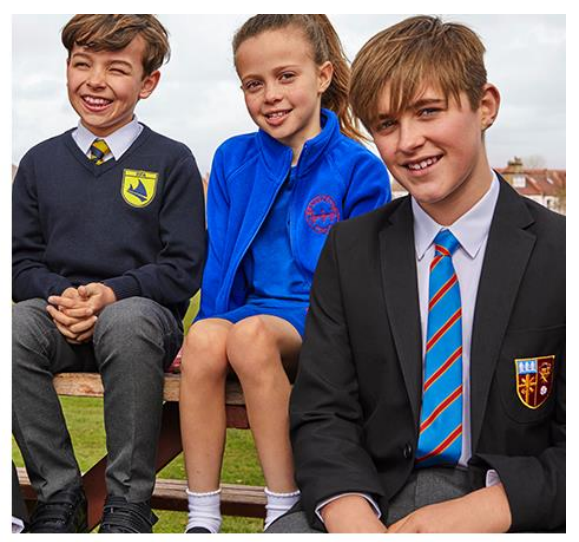
Welcome to M&S Your School Uniform. We are proud to supply personalised school uniform to schools across the UK. Remember, each time you use our service your school will benefit. It's a simple and straightforward way to help raise money for your school!