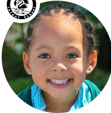
Emmbrook Infant School