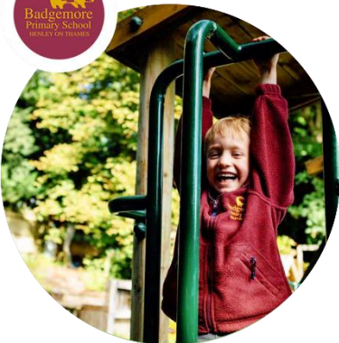
Badgemore Primary School