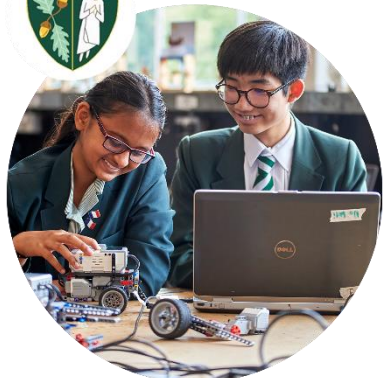
St Crispin's School