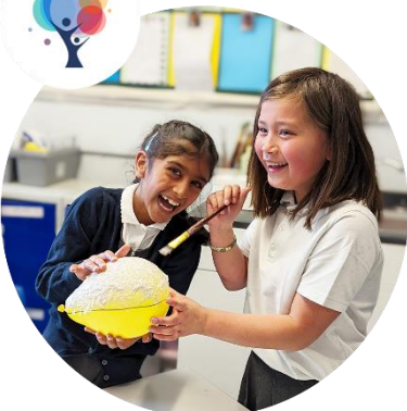
Nine Mile Ride Primary School