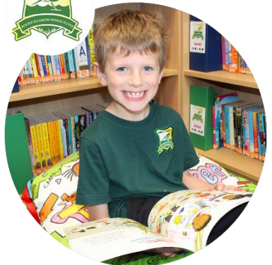
Emmbrook Junior School