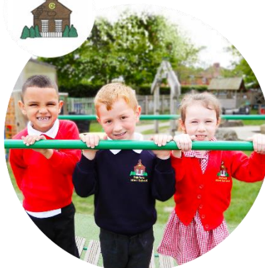
Shinfield Infant and Nursery School