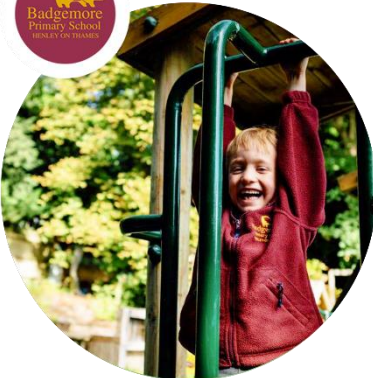
Badgemore Primary School