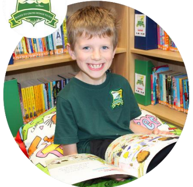
Emmbrook Junior School