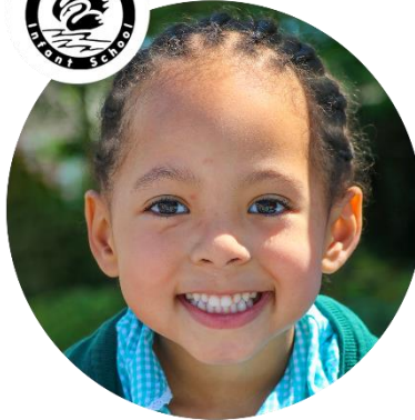
Emmbrook Infant School