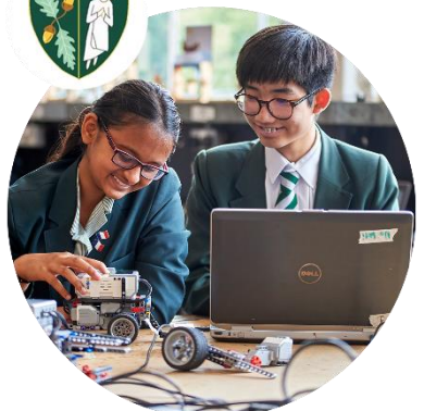
St Crispin's School