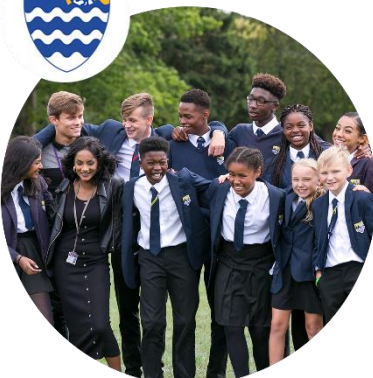
The Emmbrook School