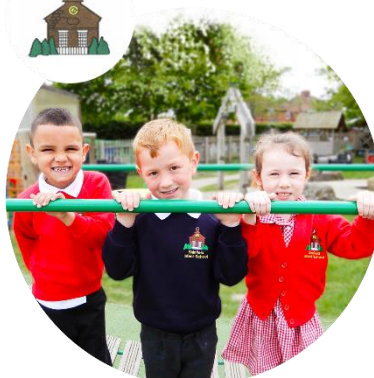
Shinfield Infant and Nursery School