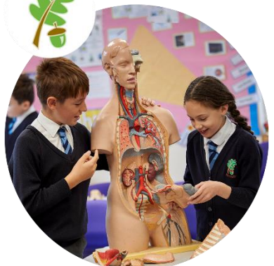
Westende Junior School