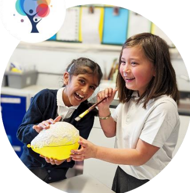
Nine Mile Ride Primary School