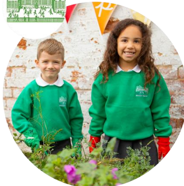
Wescott Infant School